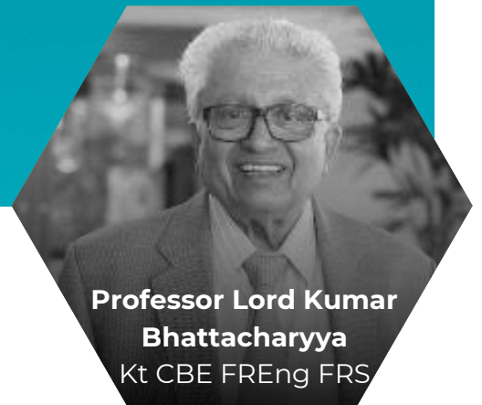
Professor Lord Kumar Bhattacharyya Kt CBE FEng FRS